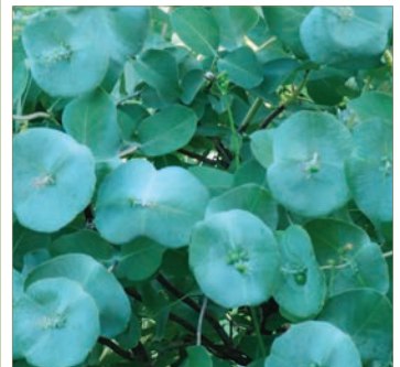
Lonicera 'Kintzley's Ghost'