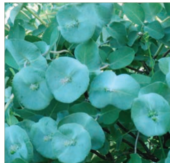
Lonicera 'Kintzley's Ghost'