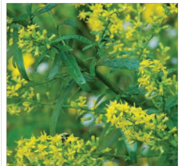
Solidago speciosa (taller than caesia)