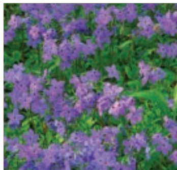
Phlox stolonifera 'Sherwood Purple'