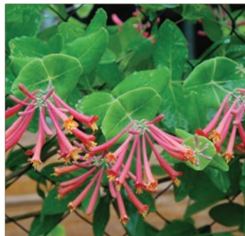
Lonicera sempervirens 'Major Wheeler'