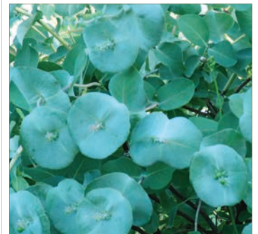
Lonicera 'Kintzley's Ghost'