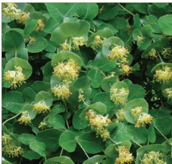
Lonicera 'Kintzley's Ghost'