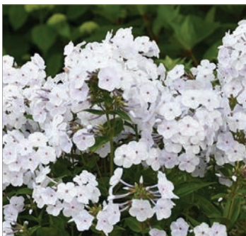
Phlox 'Fashionably Early Crystal'