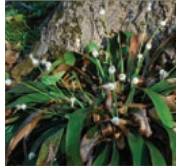
Carex (Cymophyllus) fraserianus